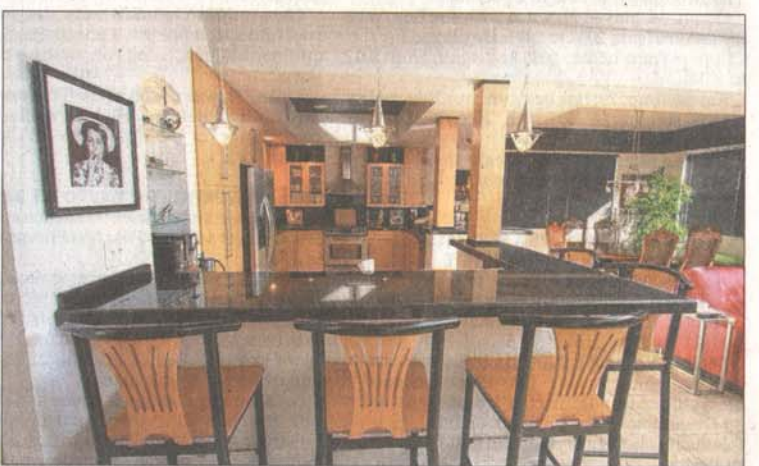
The kitchen has open views to the dining and living rooms and features granite counter tops and wood cabinets.