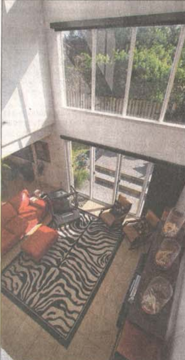
The great room has an open vaulted ceiling.