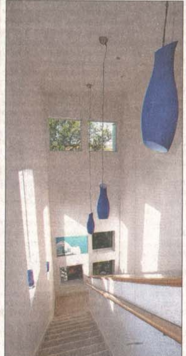
Long hanging lights accent the staircase.